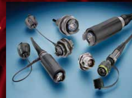
RUGGED OPTICAL ASSEMBLIES