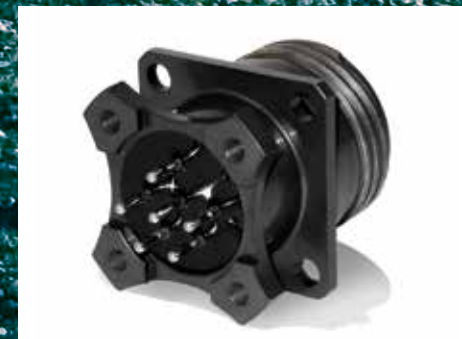
EVOMAX EMI FILTER CONNECTORS