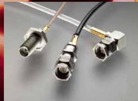
RF CABLE AND CONNECTORS