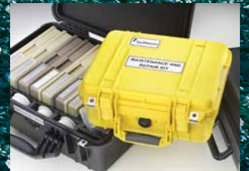
MAINTENANCE AND REPAIR KITS

Our expertise in advanced materials yields wire and cable that's smaller, lighter, and tougher than traditional counterparts, with wide temperature ranges, resistance to fuels and contaminants, and options for EMI/EMP shielding. They also offer the flexibility to route through tight spaces and sharp turns.