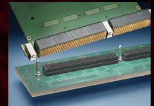
MULTIGIG RT 2-R CONNECTORS

With numerous mounting options, our mid-range crystal can relays handle t5 to 50 A in compact or standard cases. Terminal styles include socket pins, solder pins, and hook solder terminals. The balanced force design with permanent magnet drive increases reliability in harsh environments.