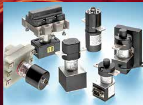
RELAYS AND CONTACTORS