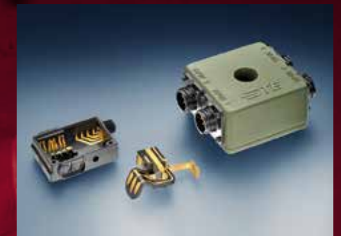
COMPOSITE ENCLOSURES AND ANTENNAS

Wildcat connectors provide higher densities in familiar circular formats. Wildcat 38999 connectors offer nearly twice the contact density than comparable 38999 Series III connectors. For size- and weight-critical applications, Wildcat Micro connectors offer between 3 and 9 contacts. Both types withstand extreme temperatures and resist vibration and corrosion.