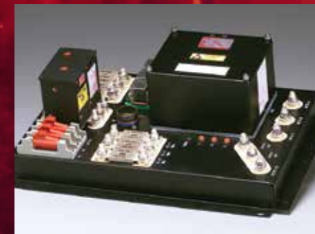
CUSTOM POWER DISTRIBUTION UNITS