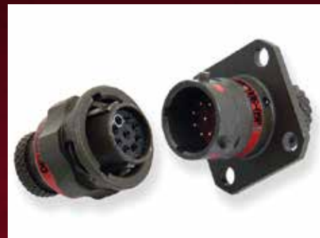
WILDCAT MICRO CONNECTORS