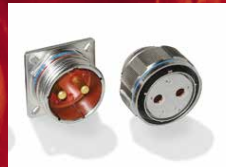
DTS-HC SERIES POWER CONNECTORS