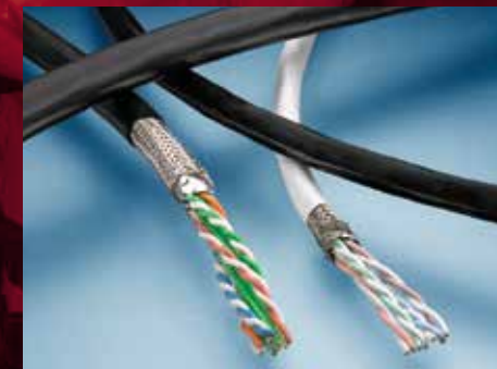
HIGH-SPEED COPPER CABLES