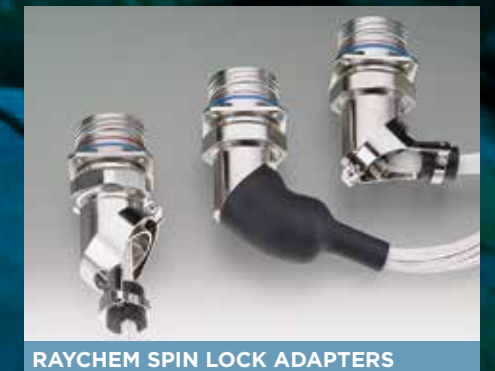
RAYCHEM SPIN LOCK ADAPTERS

A full line of rack-and-panel connectors support power, signals, RF, and optics in modular high-density rectangular connectors for easier “black-box” installation and removal of LRUs and similar equipment.