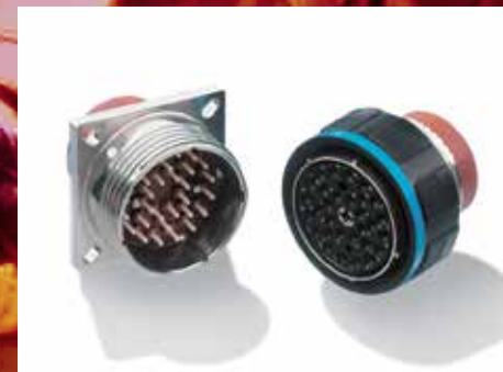
MC5 SERIES OPTICAL CONNECTORS