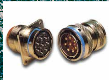
AFD SERIES CONNECTORS