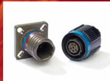
DTS SERIES 38999 CONNECTORS