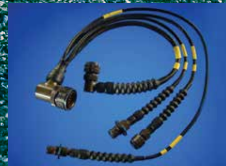
SEALED HARNESS ASSEMBLIES