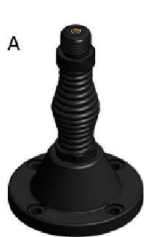
A NATO 4-hole Spring 4 x M10 or 3/8" Bolts on 114mm PCD Base diameter 140mm Base height 215mm

Bases are available to suit most installations including vehicle, mast and shelter mounting. Many are available with optional L1 & L1/L2 GPS. All bases are supplied with a protective top cap. See below for mounting options:-