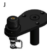
J Mast Mount Bracket 24mm Spigot 40mm Spigot 50mm Spigot Customer Specified