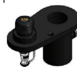
I Mast Mount Bracket 40mm Socket 50mm Socket Customer Specified