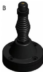
B NATO 4-hole Spring GPS 4 x M10 or 3/8" Bolts on 114mm PCD Base diameter 140mm Base height 240mm