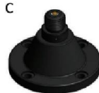
C NATO 4-hole Rigid 4 x M10 or 3/8" Bolts on 114mm PCD Base diameter 140mm Base height 100mm