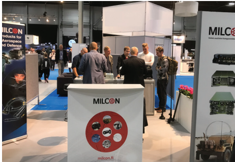
The busy Milcon Oy stand at the Comprehensive Security exhibition in Lahti, Finland