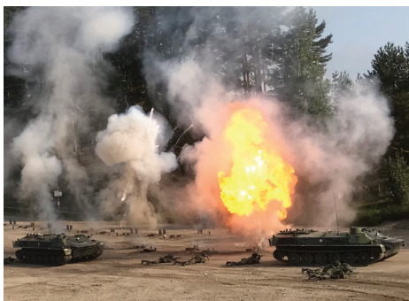
Live firing demonstration by Finnish Defence Forces at the event in Lahti